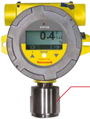
RAEGuard 2 Fixed Sensor Head