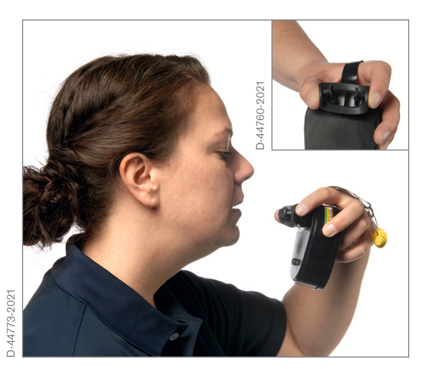
Press the mouthpiece-tabs together and insert the mouthpiece into your mouth, holding it in place with your teeth and your lips around it.