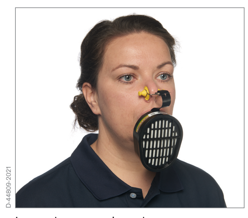
Leave the contaminated area immediately.