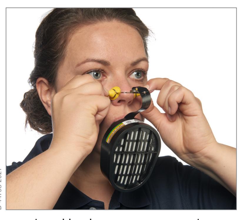
... and position it on your nose so that it closes your nostrils.