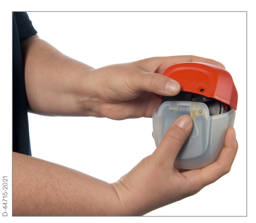
Open the cover of the case. The anti-tamper seal breaks automatically.