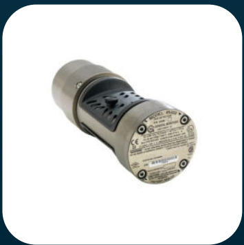
IR400 Point IR Gas Detector

The IR400 Infrared (IR) Point Detector is a hydrocarbon gas detector that continuously monitors combustible gases and vapors within the lower explosive limit (LEL) and provides alarm indication. It features an industry-leading response time of less than 3 seconds, even with a splash guard installed.