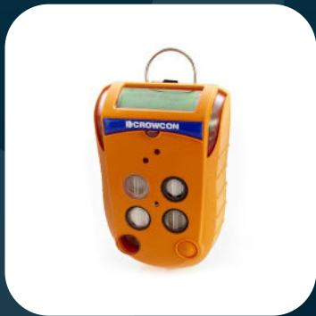
Crowcon Gas Pro

Gas-Pro is for detection of a variety of multiple gas configurations as well as confined space process guidance by offering 5 gas support including a dedicated pre-entry check mode and optional pump feature.