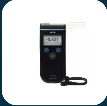
Dräger Alcotest® 6820

The fast and compact Dräger Alcotest® 6820 alcohol detection device meets the stringent requirements of professional breath-alcohol analysis. With its DrägerSensor, this robust alcohol tester guarantees rapid response times and precise test results in all weather conditions and can be adapted to international guidelines.