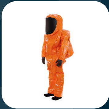
Dräger CPS 5900

The Dräger CPS 5900 is the ideal limited-use, gas-tight chemical protective suit for hazmat incidents.