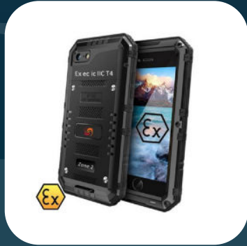
Apple iPhone SE For use in Zone 2

These explosion-proof iPhones are originally manufactured by Apple and then converted and certified according to the ATEX directives by Atexxo Manufacturing, making the mobile phones suitable for safe use in gas and vapour (Zone 2) hazardous locations.