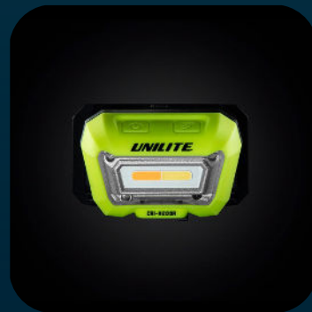
CRI-H200R LED HEAD TORCH

A powerful 200 lumen output with a high CRI of 96+, as well as 3 different temperatures of 2500k / 4500k / 6500k. Motion sensor activated, the head torch can be controlled with a simple swipe to turn on and off. IK07 shock resistance provides enhanced protection, whilst a high IP65 rating safeguards against dust & water.