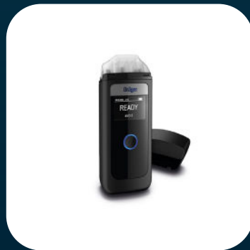
Dräger Alcotest® 4000

The breathalyser Dräger Alcotest® 4000 offers responsible drivers a reliable way to test their breath alcohol and gives them the assurance of being legal to drive.