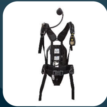
Dräger PSS 7000

Suited for firefighting, the PSS 7000 can ensure the user has reliable protection when working in toxic environments. Designed for maximum comfort, this device is made with a rigid harness connection to an adjustable backplate and pivoting waist belt.