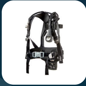
Dräger PSS 3000

This SCBA unit exhibits outstanding thermal, impact and chemical resistance. Its ergonomic build provides a comfortable fit that is easy to don and doff.