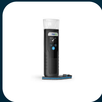
Dräger Alcotest® 5000

The Dräger Alcotest® 5000 is a professional breath-alcohol tester which detects the presence of alcohol. The high-speed breathalyser lets you perform numerous tests in no time. Its special funnel reduces the back-flow of expired air to a minimum, preventing the risk of infection to subsequent test subjects.