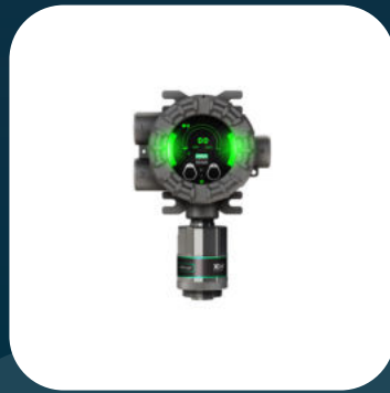
ULTIMA® X5000 Gas Monitor

The ULTIMA® X5000 Gas Monitor is the future of gas detection for oxygen, toxic and combustible gases. MSA XCell® gas sensors with TruCal® technology offer calibration cycles up to 24 months (local calibration respected).