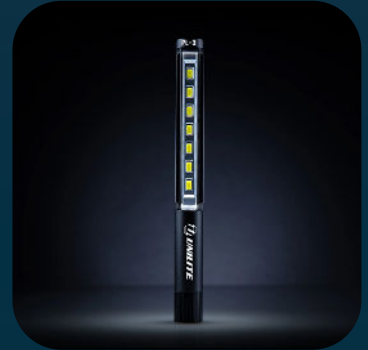
PL-3 POCKET INSPECTION LIGHT

A preconfigured Ex-Handy 10 DZ1 / Ex-Handy 10 DZ2 which focuses on the main purpose: being a phone.