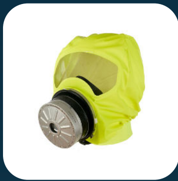
Dräger Parat 7500

The high-performance filter protects against a wide range of fire and toxic industrial gases, vapours and particles. The ABEK CO P3 Filter is approved for EN standard 403:2004 for fire escape hoods, the DIN standard 58647-7 for filtering escape devices and is tested in accordance with the EN standard 14387:2004 for gas filter(s) and combined filter(s).