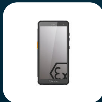
IS655.2 ATEX Zone 2 / 22 Certified

This slim smartphone combines elegant and extremely robust design and is equipped with the latest technology, a fast processor and PTT button for uncomplicated team communication. The lightweight smartphone is Android Enterprise Recommended, zero-touch capable and MDM compatible.