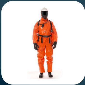
Dräger CPS 5800

The gas-tight Dräger CPS 5800 (type 1b) protects against a multitude of substances meeting the highest requirements of fire departments and shipping.