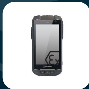
IS530.1 ATEX Zone 1 / 21 Certified

Always a step ahead! The smart and innovative Zone 1/CI I Div1 smartphone with the most advanced technology: The first Bluetooth® 5.0 industrial smartphone with a multifunctional ISM interface, a huge internal memory of 64 GB and the highest camera resolution of its class.