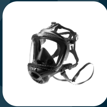
Dräger FPS 7000

Ideal for use with the Dräger PSS BG4 CCBA this breathing mask is made from strong EPDM and features a strong APEC polycarbonate visor that offers 180 degree visibility. With an anti-scratch lens and anti-misting interior, this mask ensures the user has maximum visibility at all times.