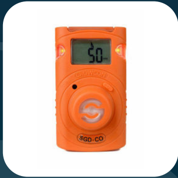
Crowcon Clip SGD

Able to accommodate various gas settings, including CO, H2S, O2, and SO2, this generous range of gas monitors provides you with a seamless user experience that will streamline your workday.