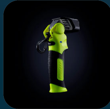
RA-700R INSPECTION LIGHT

With a useful 130° rotating head to angle light direction; the RA-700R is a feature packed right angled work light. High CRI96+ 700 lumen COB LED main beam as well as a red light LED with static & flash modes. In built 4500mAh Li-ion rechargeable battery charged via magnetic charging station, or Type-C USB (both included).