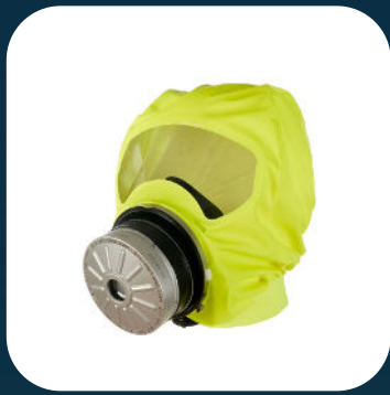
Dräger Parat 4700

This industrial escape hood was developed with users, placing the focus on the fastest possible escape. Optimized operation and wearing comfort, a robust housing and a tested ABEK P3 filter ensure protection from toxic industrial gases, vapours and particles for at least 15 minutes.