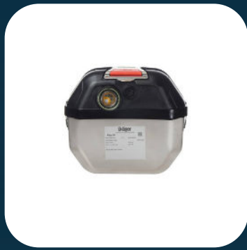
Dräger Oxy SR 30 / 60

The Dräger Oxygen Self Rescuers are easy and fast to handle, even under extreme conditions.