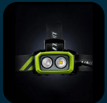
HT-680R HIGH CRI HEAD TORCH

This slim smartphone combines elegant and extremely robust design and is equipped with the latest technology, a fast processor and PTT button for uncomplicated team communication. The lightweight smartphone is Android Enterprise Recommended, zero-touch capable and MDM compatible.