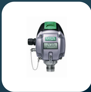
PrimaX® I Gas Transmitter

Indoors or outdoors, our PrimaX I Gas Transmitter provides dependable, accurate gas detection. The transmitter detects toxic gases and oxygen and is housed in an antistatic, reinforced nylon enclosure.