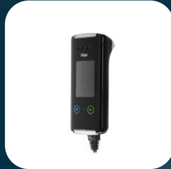
Dräger Interlock® 7000

The Interlock® 7000 is an alcohol ignition interlock device (AIID) which prevents a person under the influence of alcohol from starting a vehicle.