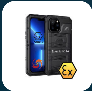
iPhone 13 Pro For use in Zone 2

Compliance with ATEX / EX regulations is achieved by upgrading the casing of the iPhone 13 which combined with the intrinsically safe electrical circuit.