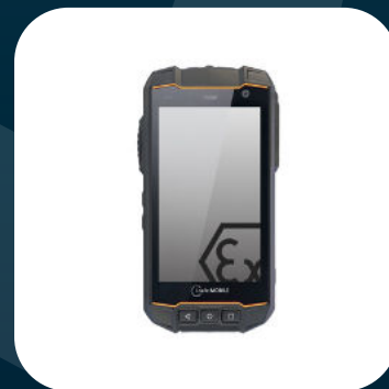
IS530.2 ATEX Zone 2 / 22 Certified

The high-performance industrial smartphone can be used in a multifunctional way thanks to the ISM interface. Additional modules such as an RSM, PTT headsets or the professional IS-TH1 barcode scanner make the IS530.1 a high-performance multifunctional device. Enterprise Recommended, zero-touch capable and MDM compatible.