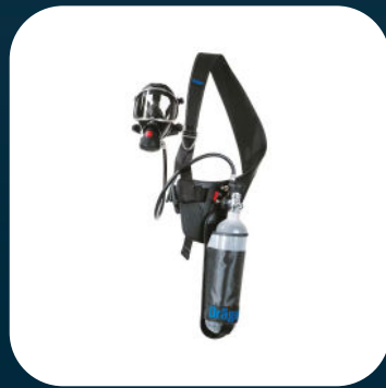
Dräger PAS Colt

With its comfortable fit and highly resistant build, this Dräger PAS Colt SCBA set is suitable for a variety of applications.