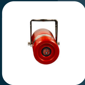
FGard UVIR Flame Detector

The Crowcon FGard UVIR flame detector is an explosion proof ultraviolet-infrared flame detector, offering superior detection of hydrocarbon fires which are not detectable in the visible spectrum.