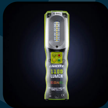
IL-SIG1 SIGNAL INSPECTION LIGHT

A powerful LED signal inspection light with a 1100 lumen output. It has solid/flashing: red, amber, green and white lights. It is fully weatherproof, rated to IP54 and is constructed of polycarbonate and die-cast aluminium. A magnetic hanging hook and multi positional kick stand make it super portable and DC-USB rechargeable.