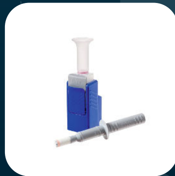
Dräger DrugCheck 3000

Use the Dräger DrugCheck 3000 to find out within minutes if a person recently consumed certain drugs. The compact and quick saliva (oral fluid) based drug test yields reliable results affordably and easily.