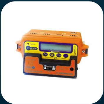
Crowcon Triple Plus+

Rugged, reliable, easy to use device with over 90,000 units being sold to oil and gas, chemical, utility and manufacturing companies worldwide.