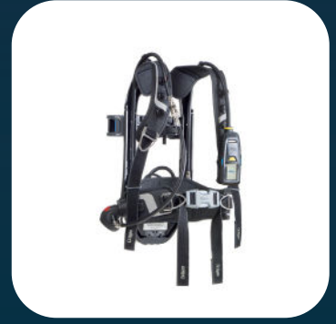
Dräger PSS AirBoss

Offers best in class ergonomics and is one of the lightest weight breathing apparatus for firefighting. Lessons learned from firefighters around the world as well as latest innovations in technology have led Dräger to design an even safer and cleaner SCBA system.