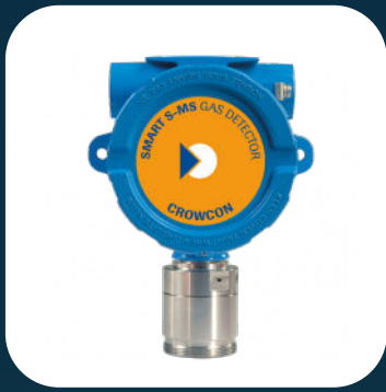
SMART S-MS MED

The SMART S-MS MED is designed specifically for use in marine environments and is certified by the Lloyd's Register in accordance with MED/3.54 Regulation. The device is SIL2 certified and has options for both catalytic and infrared sensors for the detection of flammable gases.