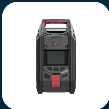
Blackline G7 Exo

This product uses a proven Ricochet mesh network, which automatically analyses the best connection in the network to communicate to. This ensures that the alarm is always received by nearby users, even if the signal between devices is weak. This eliminates the need for cables, which can be a tripping hazard, get broken or tangled as you work.