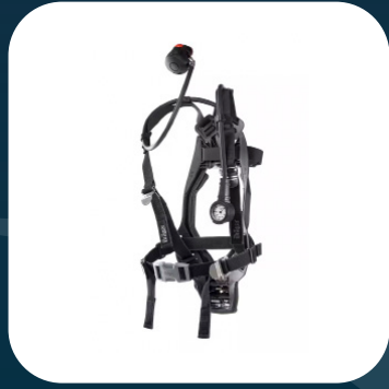
Dräger PAS Lite

SCBA kits are vital equipment for personnel operating in environments with atmospheres immediately dangerous to life and health (IDLH). These portable life-support systems provide wearers with breathable air, protecting them from harmful contaminants such as smoke, toxic gases, and airborne particulates.