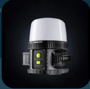
MTB-10000 SITE LIGHT

The MTB-10000 is a powerful 10000 lumen site light that supports batteries from Milwaukee, De Walt, Metabo and Makita. It has a 360-degree light output and can be dimmed multiple times to preserve battery life, as well as having multiple colour temperatures (2700K, 3500K, 4500K, 5500K, 6500K).