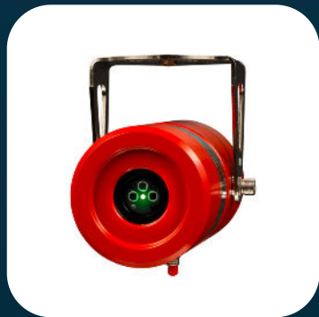
FGard H2 Flame Detector

Introducing the Fgard H2 by Crowcon, a breakthrough in Hydrogen Flame Detection.