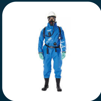
Dräger CPS 7800

The reusable gas-tight Dräger CPS 7800 provides excellent protection against gaseous, liquid, aerosol and solid hazardous substances even in explosive areas. Due to its innovative material and the new suit design it offers increased flexibility and comfort when entering confined spaces and working with cryogenic substances.