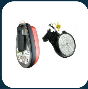
Dräger Parat 3200

The Dräger PARAT 3200 is a mouthpiece / nose clip escape device equipped with a multi-gas ABEK15 filter. Packed in a robust and ergonomic case, the unit is compact and easy to carry. Approved to (DIN 58647-7), it provides users a minimum of 15 minutes escape time.