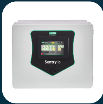
SENTRY io® Controller

MSA's core products include self-contained breathing apparatus, fixed gas and flame detection systems, portable gas detection instruments, industrial head protection products, fire and rescue helmets, and fall protection devices.