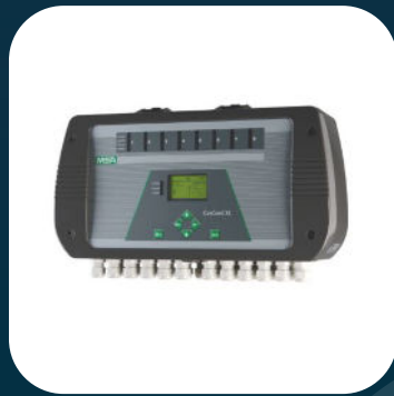
GasGard® XL Controller

Monitor up to eight remote gas sensors with the highly accurate wall-mounted GasGard XL Controller. The controller's large, multi-language LCD display provides real-time readings, offers full-system diagnosis and shows intuitive icons.