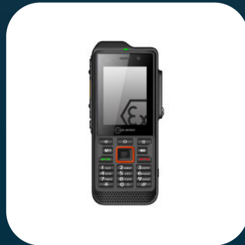
Exloc IS330.1 Zone 1 Android Phone

The Exloc IS330.1 Zone 1 android phone is Rugged, safe, and built for any challenge!