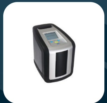
Dräger DrugTest 5000

No pipetting, no drips, no timing: With the Dräger DrugTest 5000, a drug test is carried out simply and quickly.