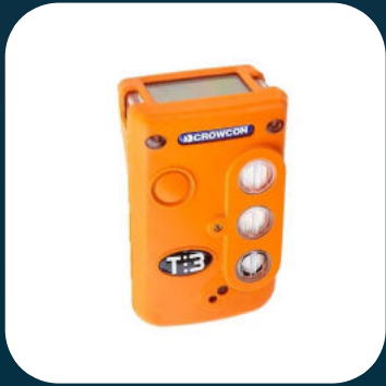
Crowcon Tetra 3

The Tetra 3 multi-gas monitor is a compact, robust and easy-to-use diffusion based detector. Single button operation, small size and clear top-mounted display make it a favourite in the market amongst those working in demanding industrial environments, such as those in the water, telecoms, food, brewing or hydrocarbons sectors.