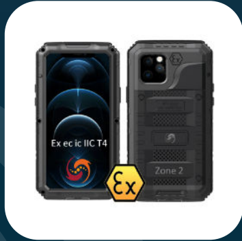
ATEX iPhone 12 For use in Zone 2

The ATEX iPhone 12 comes with a durable black case finish and is available for the iPhone 12 with 64GB, 128GB or 256GB. Besides being safe to use as an EX smartphone, the versions are excellent for intrinsically safe video or photo camera use with Bluetooth and/or Wi-Fi connection.