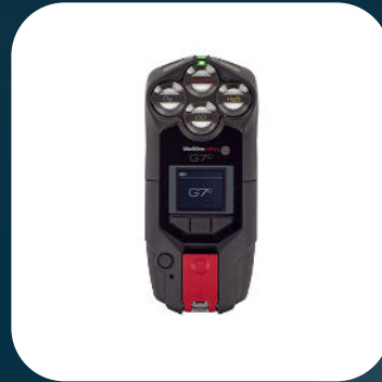
G7c Multi-gas Pump

The G7c gives you unprecedented control over each confined space entry and a leak check your team performs. Quickly adapt to the environment or evolving circumstances by flipping between diffusion and pump configuration modes at any time – and all with the standard features of G7 single-gas and multi-gas devices.