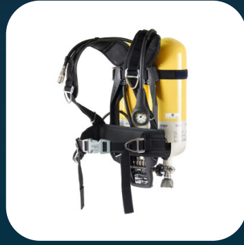
Dräger PSS 4000

Thanks to its advanced material and innovative design, the Dräger PSS 4000 is one of the lightest self-contained breathing apparatuses (SCBA) available. With unparalleled wearer comfort and exceptional pneumatic performance, the PSS 4000 SCBA provides the user with simplicity and ease of use in a wide range of demanding environments.