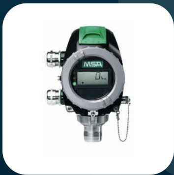
PrimaX® P Gas Transmitter

Designed to detect gases indoors or outdoors, our PrimaX P Gas Transmitter measures oxygen and toxic and combustible gases. The flameproof transmitter is housed in a powder-coated aluminum enclosure that will protect it in extremely dangerous conditions.