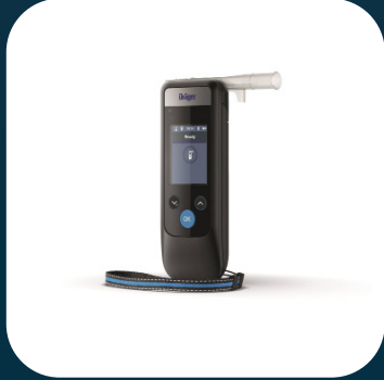
Dräger Alcotest® 7000

The Alcotest 7000 sets new standards in alcohol test devices.