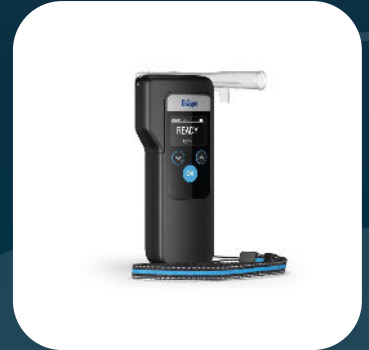
Dräger Alcotest® 6000

The Dräger Alcotest® 6000 allows the professional user to perform a breath alcohol test with speed and precision.