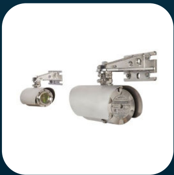
Senscient ELDS™ Open Path Gas Detector

The Senscient ELDS laser-based open path gas detector is available for a wide range of toxic and flammable gases. The Senscient ELDS uses 'SimuGas' self-testing to eliminate employees entering hazardous areas for gas checks. Nuisance false alarms are virtually eliminated with its breakthrough Harmonic Fingerprint processing.