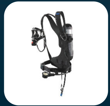
Dräger PAS Micro

The advanced Dräger PAS Micro Escape Set is a reliable solution to short-duration and emergency escape units.