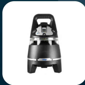
Dräger X-Zone 5500

The world's first direct-to-cloud area monitor that delivers ultimate visibility into your entire facility and workforce. With integrated 4G and optional satellite connectivity, the G7 EXO automatically links to the Blackline Safety Cloud where it can integrate and work alongside employee-worn G7 devices.