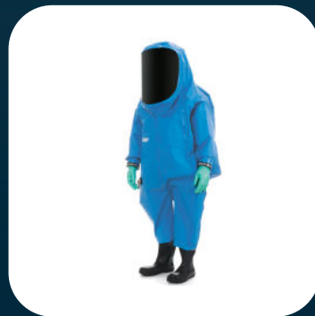
Dräger CPS 7900

Tailor-made for use under extreme conditions: The gas-tight Dräger CPS 7900 provides excellent protection against industrial chemicals, biological agents, and other toxic substances. Its innovative material qualifies the CPS 7900 equally well for work in explosive areas and for handling cryogenic substances.