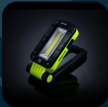
SLR-500 WORK LIGHT

The SLR-500 is a compact USB rechargeable work light with a bright 500 lumen output. Its folding 180° stand contains a useful carabiner hook and strong integral magnets. In addition to its flood beam it also has a 300 lumen top torch. An IPX5 rating also ensures high water resistance.