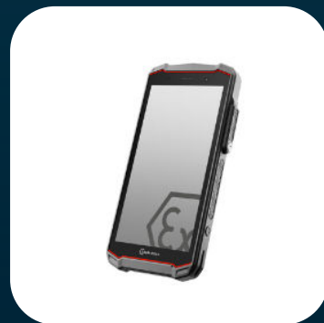
IS540.1 ATEX Zone 1 / 21 Certified

The World's first 5G ATEX Zone 1 smartphone is here thanks to i.safe MOBILE! The 6-inch full HD display on this smartphone offers the highest quality images with a 48MP main camera and wide range frequency bands for industrial applications. The 16-pin ISM interface enables a secure connection to a barcode scanner.