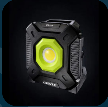
MTB-5300 MULTI TOOL BATTERY LIGHT

The MTB-5300 is a powerful 5300 Lumen LED site light that supports batteries from Milwaukee, De Walt, Metabo and Makita, as well as mains power.