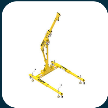
Standard Kit 7