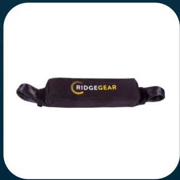
RGL7 Shock Absorber

The RGL7 is a standalone shock absorber pack. It is commonly seen being used on our lanyards, but can also be used on its own without adding an additional lanyard.