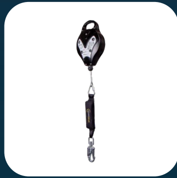
RGA2/EDGE Fall Arrest Block – 10m

A popular multipurpose fall arrest block, which provides semi permanent protection whilst allowing uninhibited movement during working activities.