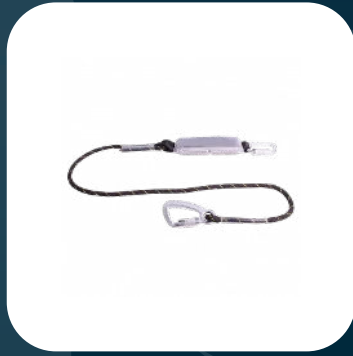
RGL11 Kernmantle Rope Lanyard & Shock Absorber

This single leg fall arrest safety lanyard is manufactured from kernmantle rope (which shows resistance to alkalis, oils and organic solvents)