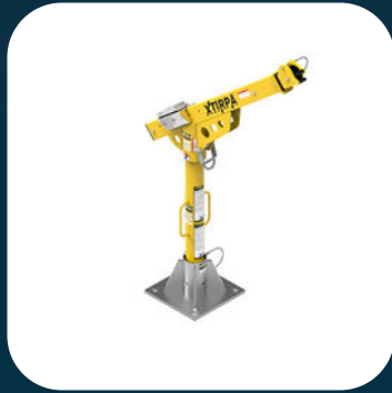
Standard Kit 4