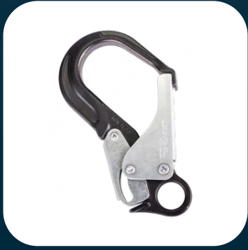
RGK88 62mm Aluminium Double Action Scaffold Hook

This scaffold hook is ANSI approved and has a large gate opening, perfect for connection to scaffold and steel structures.