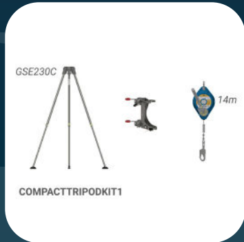
Compact Kit 1