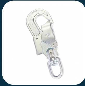
RGK45 21mm Steel Double Action Swivel Snap Hook

This snap hook is double action and locks automatically.