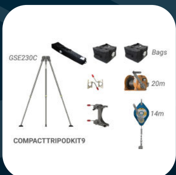
Compact Kit 9