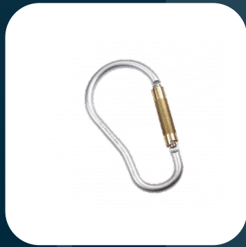
RGK5 56mm Steel Twistlock Scaffold Karabiner with Captive Pin

This scaffold karabiner has a large gate opening of 56mm meaning it is ideal for use in industrial areas and can clip directly onto scaffolding/steel working.