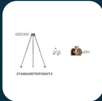
Standard Kit 4