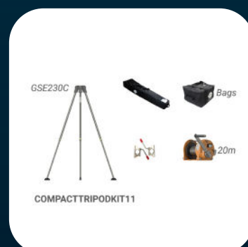
Compact Kit 11