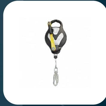
RGA4 Fall Arrest Block with recovery winch – 15m

A three way retrieval block with the expected fall arrest capabilities, but with the added extra of an up/down winch mechanism. The recovery feature means operatives who have experienced a fall can be winched up or down to safety.