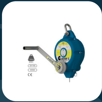
Compact Kit 1