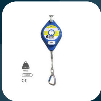
Compact Kit 5