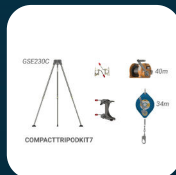
Compact Kit 7