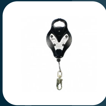
RGA2 Fall Arrest Block – 10m

A popular multipurpose fall arrest block, which provides semi permanent protection whilst allowing uninhibited movement during working activities.