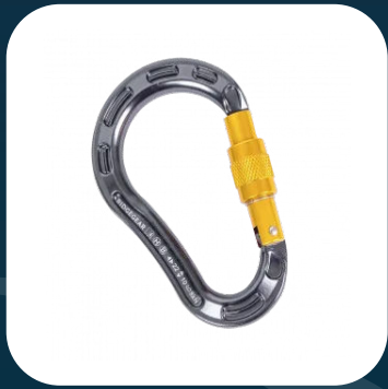
RGK7 26mm Aluminium Screwgate HMS/Belay Karabiner

The HMS or belay karabiner has a wide load bearing design allowing for smooth running of your rope.