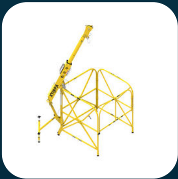
Standard Kit 8