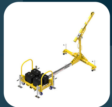
Standard Kit 10