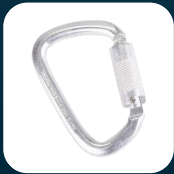
RGK3 24mm Steel Twistlock Karabiner

A robust and strong karabiner to abide by ANSI standards. Usually used to clip to fall arrest safety lanyards and horizontal temporary anchor lines due to a larger opening of 24mm.