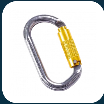
RGK1/AT 19mm Triple Action Aluminium Karabiner

The RGK1/AT is a triple action alternative to the RGK1/A.