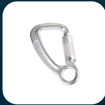
RGK18 18mm Steel Triple Action Karabiner

This karabiner benefits from a forged profile with a large gate opening and captive eye.