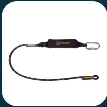
RGL2 Kernmantle Rope Lanyard & Shock Absorber

This single leg fall arrest safety lanyard is produced using 11mm kernmantle rope with machine stitched connection eyes at each end.