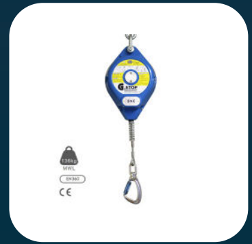
Compact Kit 4