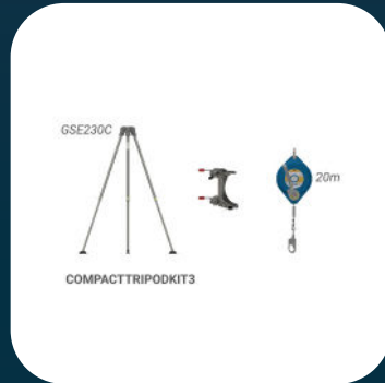
Compact Kit 3