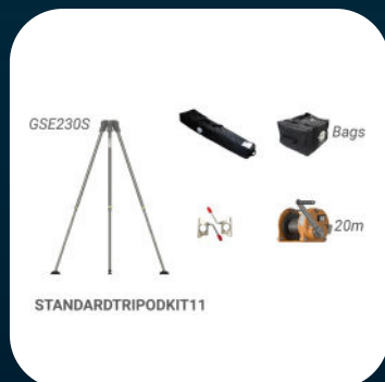
Standard Kit 11