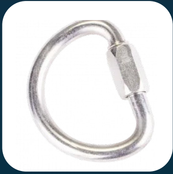
RGK20 10mm Screw-gate Delta Link

The RGK20 is normally used as a central connection link at the attachment point of the front of an adventure/climbing harness.