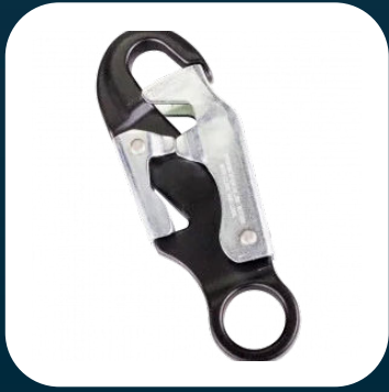
RGK50 18mm Step Bolt Connector

The flat profile of this connector make it the most suitable for use when clipping to step bolts.