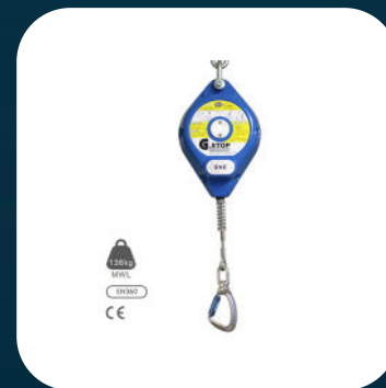
Compact Kit 7