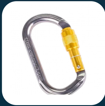
RGK1/A 19mm Screwgate Aluminium Karabiner

The RGK1/A is a lightweight alternative to the RGK1. The screwgate closure on this device means that the user must manually lock the RGK1/A keeper after fitting.