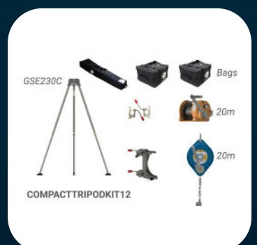
Compact Kit 12