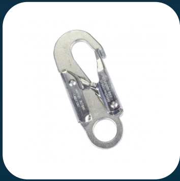
RGK10 19mm Steel Double Action Snap Hook

This snap hook is usually used as an alternative to a twistlock connector. It has a 19mm double action self closing gate which can be clipping directly onto a safety harness' D ring.