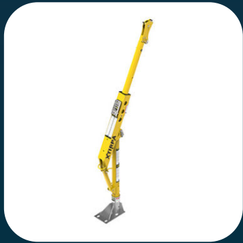
Standard Kit 1