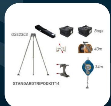
Standard Kit 14