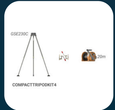
Compact Kit 4