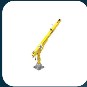
Standard Kit 5