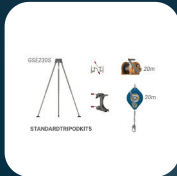
Standard Kit 5