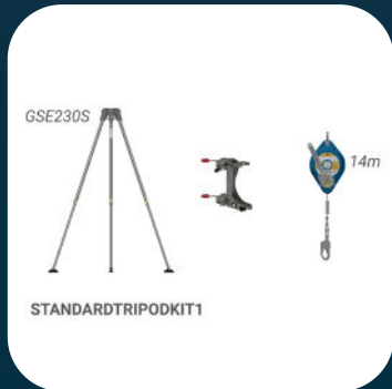
Standard Kit 1