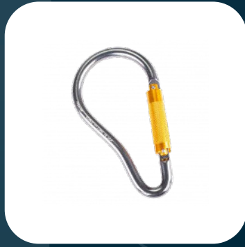
RGK6 54mm Aluminium Twistlock Scaffold Karabiner with Captive Pin

A lightweight scaffold karabiner with a 54mm gate opening giving the option to clip to scaffolding/steel structures.