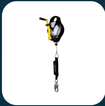
RGA4/EDGE Fall Arrest Block with recovery winch – 15m

A three way retrieval block with the expected fall arrest capabilities, but with the added extra of an up/down winch mechanism.