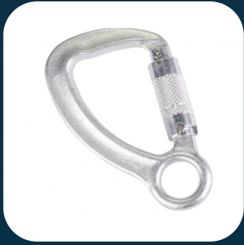
RGK19 23mm Steel Triple Action Karabiner

Similar to the RGK18, this strong and extra safe karabiner also benefits from a forged profile with captive eye and slightly wider gate opening.