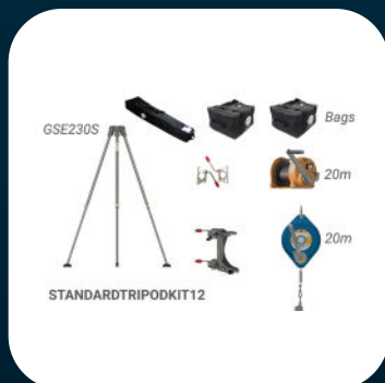
Standard Kit 12