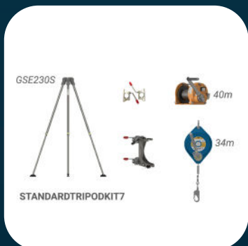
Standard Kit 7