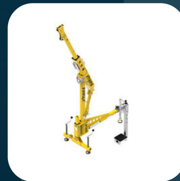
Standard Kit 9