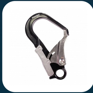
RGK11/SL 55mm Super Light Double Action Aluminium Scaffold Hook

A lightweight alternative to our double action scaffold hook, at almost half its weight. This is the perfect scaffold hook when weight is of high importance.