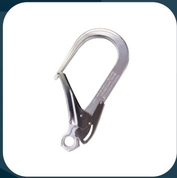
RGK11/LSH 110mm Aluminium Double-Action Scaffold Hook

The RGK11/LSH is our largest scaffold hook, with a greater gate opening.