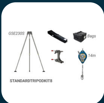
Standard Kit 8