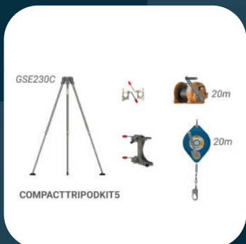
Compact Kit 5