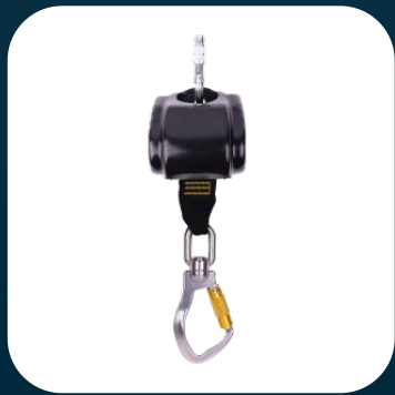
RGA1 Fall Arrest Block – 2.5m (Webbing)

The perfect personal issue fall arrest block for operatives working at height at a length of 2.5m.