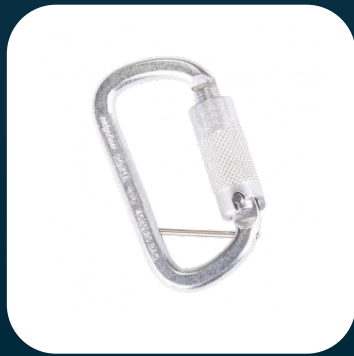
RGK15 12mm Steel Triple Action Karabiner with Captive Pin

An ANSI approved karabiner which means exceptional strength and extra peace of mind.