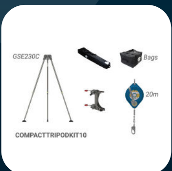
Compact Kit 10