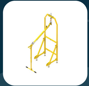
Standard Kit 6