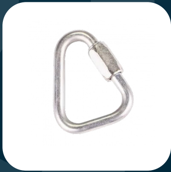
RGK12 10mm Steel Screwgate Delta Link

This connector offers a semi-permanent connection fall arrest equipment.