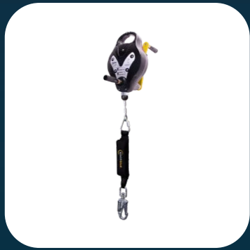
RGA4H/EDGE Fall Arrest Block with recovery winch

A three way retrieval block with the expected fall arrest capabilities, but with the added extra of an up/down winch mechanism and steadying handle.