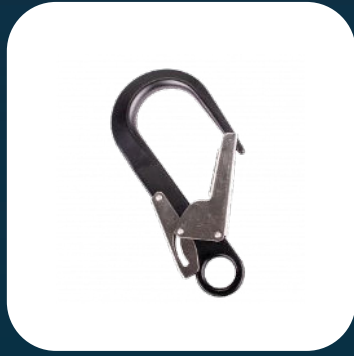
RGK11 60mm Aluminium Double Action Scaffold Hook

A double action scaffold hook produced from aluminium which is usually used in conjunction with a fall arrest safety lanyard for quick clipping onto scaffold or steel structures.