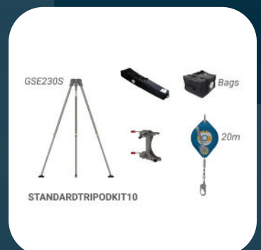
Standard Kit 10