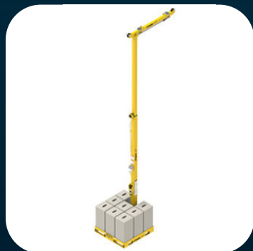
Standard Kit 11