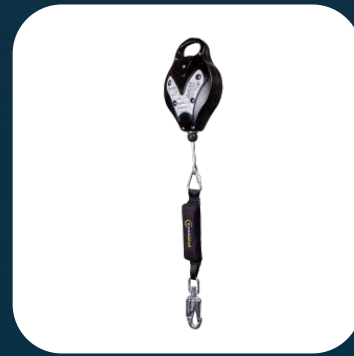
RGA3/EDGE Fall Arrest Block – 15m

The RGA3/EDGE is a robust fall arrest block with a long working length and heavier construction.