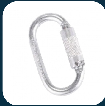
RGK2 17mm Steel Twistlock Karabiner

This karabiner is extremely safe due to it having an automatic locking system.