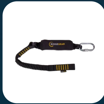
RGL6 Single Leg Elasticated Webbing Lanyard & Shock Absorber

This single leg fall arrest safety lanyard comes with an elasticated leg. This decreases the hanging slack, which can help to reduce trip hazards and entanglement.