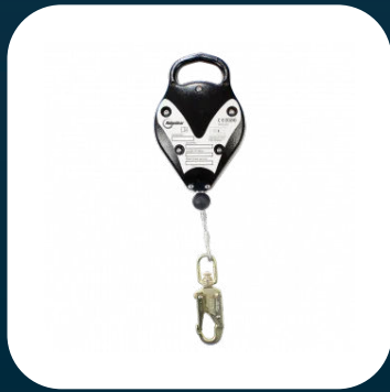
RGA26 Fall Arrest Block – 6m

The RGA26 is a multipurpose fall arrest block, with a working length of 6m. It allows uninhibited movement during normal working activity and features a carrying handle that is part of the cast alloy housing.