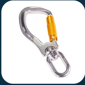
RGK44 22mm Aluminium Triple Action Karabiner

It benefits from the additional safety benefits of a triple closure and also the lightweight make up of aluminium. The captive eye ensures permanent connection to a safety lanyard or fall arrest block.