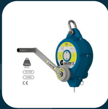
Compact Kit 2