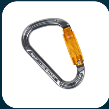
RGK4 22mm Aluminium Twistlock Karabiner

Produced from aluminium, so this karabiner is extremely lightweight. The double action gate opening is 22mm and twistlock which closes automatically.