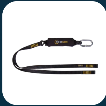
RGL3 Twin Leg Webbing Lanyard & Shock Absorber

This twin leg fall arrest safety lanyard is produced using our anti-bacterial protection webbing.