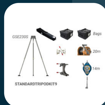
Standard Kit 9