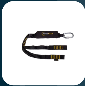
RGL9 Twin Leg Elasticated Webbing Lanyard & Shock Absorber

This twin leg lanyard comes with elasticated legs. This decreases the hanging slack, which can help to reduce trip hazards and entanglement.