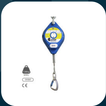
Compact Kit 6