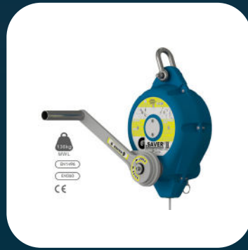
Compact Kit 3