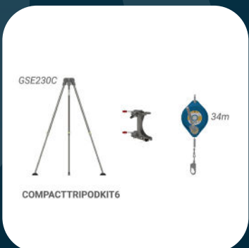
Compact Kit 6