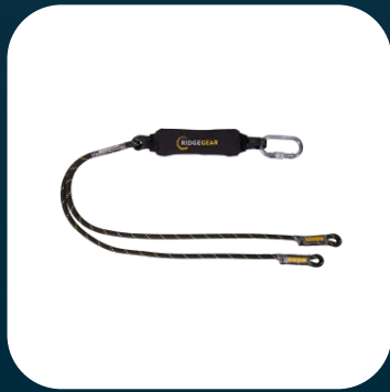
RGL8 Twin Leg Rope Lanyard & Shock Absorber

This twin leg fall arrest safety lanyard is produced using 11mm kernmantle rope with machine stitched connection eyes at each end.