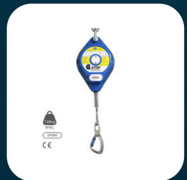
Compact Kit 8