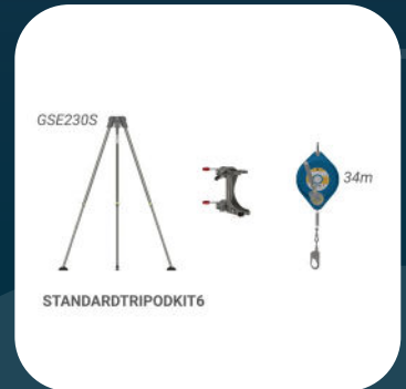
Standard Kit 6