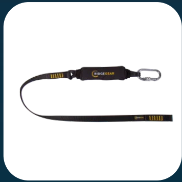
(Scroll Wheel To Zoom) RGL1 Single Leg Webbing Lanyard & Shock Absorber

This single leg lanyard is produced using our anti-bacterial protection webbing.