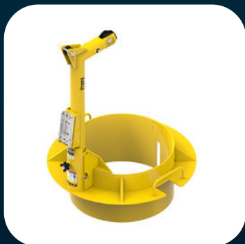
Standard Kit 12