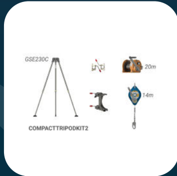
Compact Kit 2