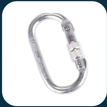
RGK1 17mm Steel Screwgate Karabiner

Our most popular karabiner from the range. An opening of 17mm and manufactured from steel.