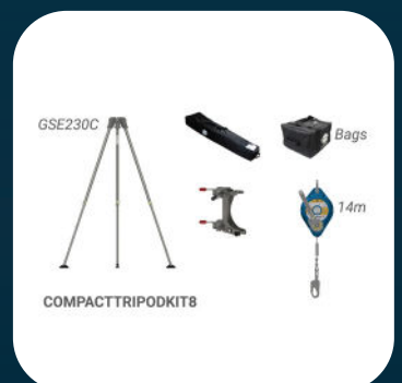
Compact Kit 8